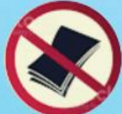
No magazines in the waiting area