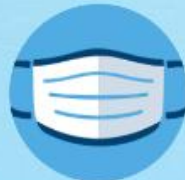
Asking you and the staff to wear a mask