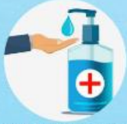
Hand Sanitizer upon arrival