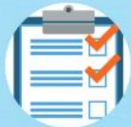
Screening questions related to COVID-19