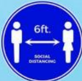
Practice physical distancing